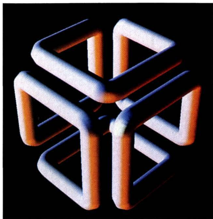
Photo 1: As rendered here, the Silicon Graphics logo contains roughly 1400 polygons. With solid surfaces, remote and local lighting, calculations of spectral characteristics of surface, and full color rendering, this object can rotate and move in real time. The animation is smooth and convincingly real.

context, so consider the model in photo 1. Iris renders this model, with over 1000 3-D polygons, smooth shading, and multiple light sources, so quickly that it simulates smooth motion by redrawing the entire model in a slightly different position several times a second.