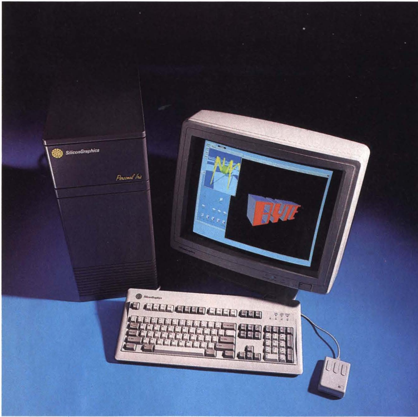
The Silicon Graphics Personal Iris Turbo workstation. I created the BYTE logo shown on-screen as a 3-D object. The Iris can set the logo in motion, recalculating and redrawing every polygon in real time.